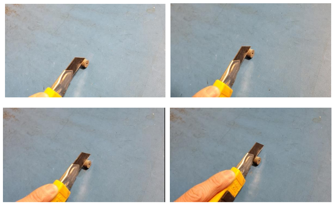
Figure 9: Scoring the OD of the pellet by rolling with light pressure on the knife.

Once the entire OD is scored then more pressure can be applied downward on the knife to completely cut the pellet in half (See Figure 10)