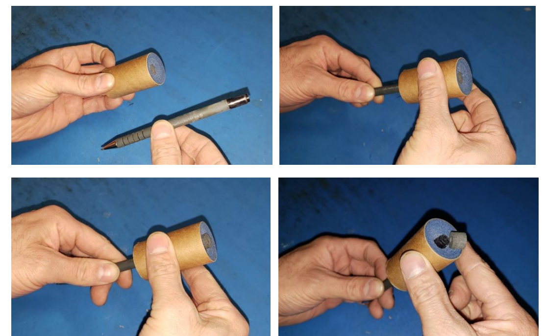
Figure 6: Pellet removal from grain.