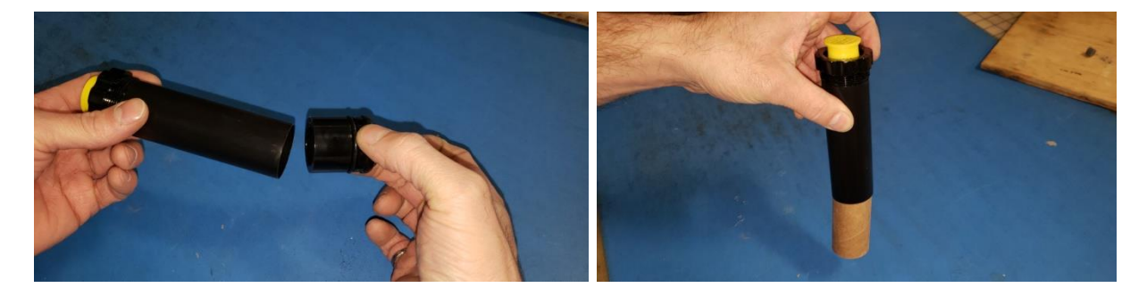
Figure 2: (LEFT) Forward closure removal (RIGHT) sliding grain out from liner in vertical position.

Note: If grains are a tight fit they can be left in the liner for this procedure