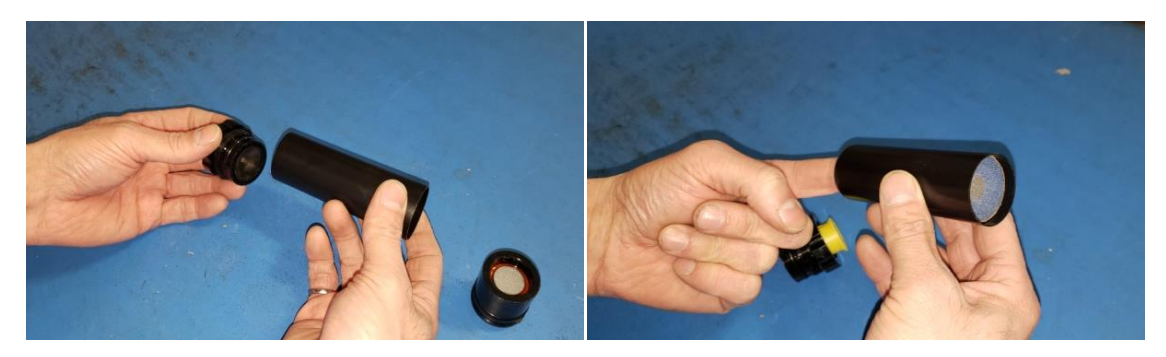
Figure 3: Removal of nozzle to extract or modify propellant grain.

4. The top propellant grain will have a pellet located in the forward section. The forward side of this grain will have a bevel shape on its face, and the aft section will be flat.