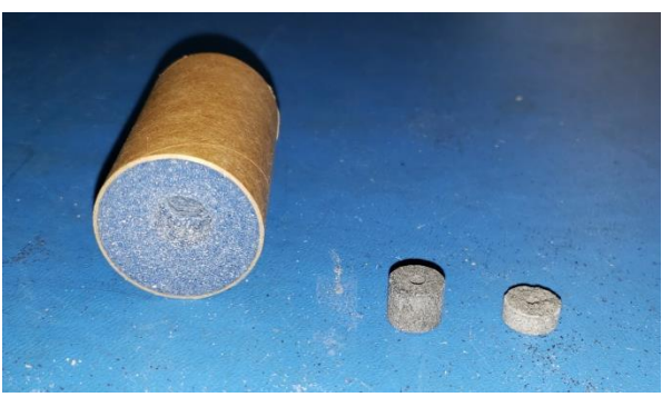
Figure 1: Modified pellet example

NOTE 2: This recall date <u>does not</u> apply based on the propellant date code stamped on the reload but on the date of purchase of the product.