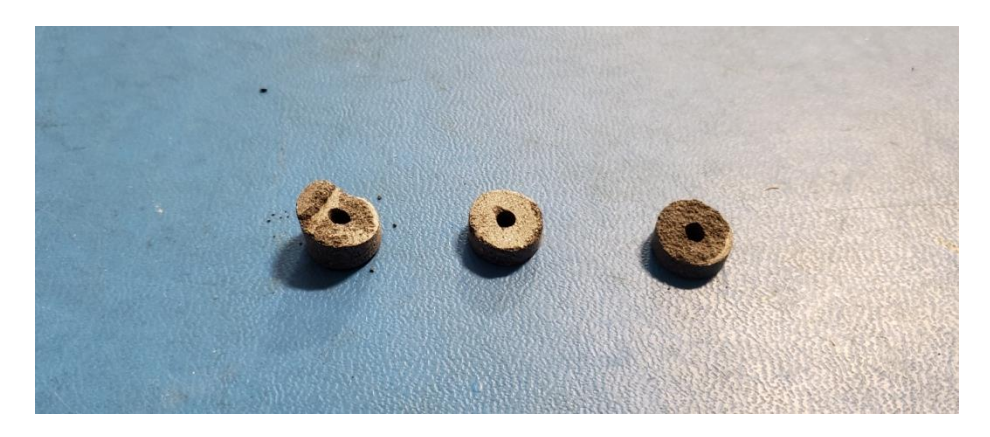
Figure 11: Pellet examples after cutting (LEFT) not cut perfectly and oversized (CENTER) additional trimmed pellet (RIGHT) as cut pellet approx 50%.

(essentially scraping or shaving the pellet). This will allow the face to be "squared" and/or remove any excess pellet surface which is greater than half. Continue to reduce the pellet size until approx 50% of the original pellet is left.