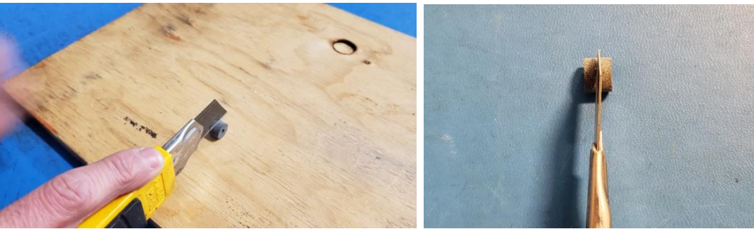
Figure 8: Pellet cutting procedure.

With the blade resting on the pellet apply a <u>light</u> amount of pressure to the knife blade and slowly roll the pellet effectively "scoring" the outside edge of the pellet. Do not try to completely cut through the pellet in one motion. Instead continue to roll the pellet until 3-4 complete revolutions are done while still applying the same light amount of pressure on the knife.