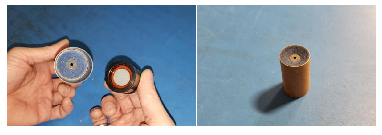
Figure 4: Grain with pellet assembly in forward section (i.e. bevel).

4. The top propellant grain will have a pellet located in the forward section. The forward side of this grain will have a bevel shape on its face, and the aft section will be flat.