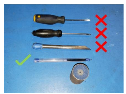
Figure 5: Type of tool to use