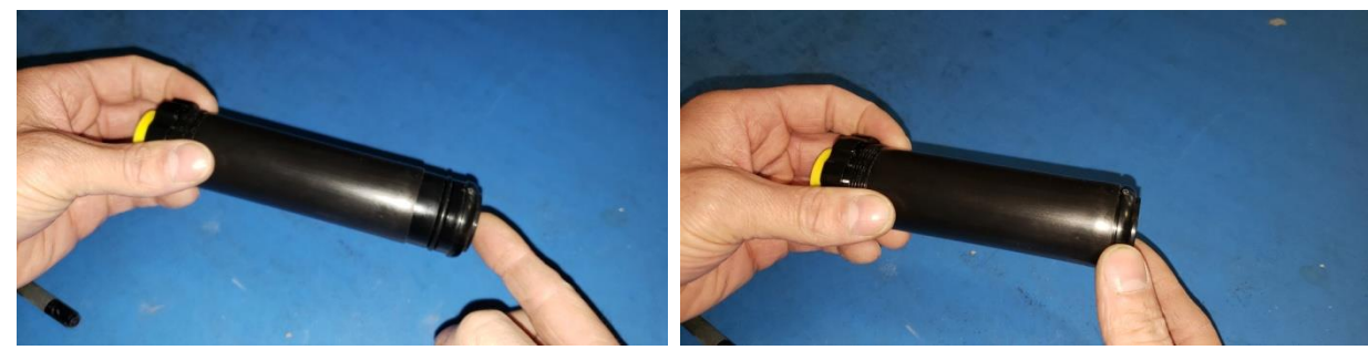
Figure 14: Re-assembly of forward closure, make sure the oring is engaged into the liner.

13. Re-assemble the forward closure from step 2 and insert it into the liner. Press the forward closure into the liner until it bottoms out on the liner or the grains and ensure the o-ring is properly seated into the liner. Take care to ensure there is no damage done to the o-ring.