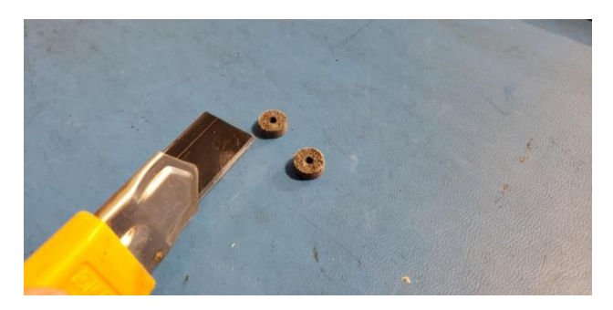
Figure 10: Pellet final cutting

Once the entire OD is scored then more pressure can be applied downward on the knife to completely cut the pellet in half (See Figure 10)